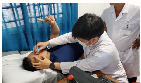
Two AB ultrasound machines, sponsored by ECF, have been delivered to the 27/2 Hospital, Sóc Trăng province and the Vinh Long Eye Hospital, both in Vietnam.