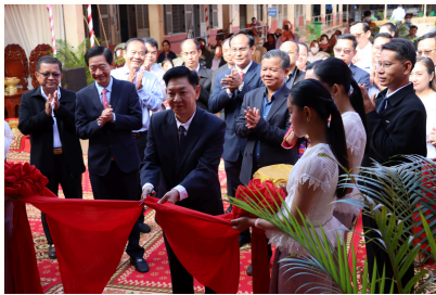
ECF supported the establishment of a new eye unit in Monduliri in Cambodia