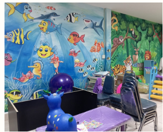
The Pediatric Out Patient Department of the National Ophthalmology Center in Laos has been renovated with ECF's assistance