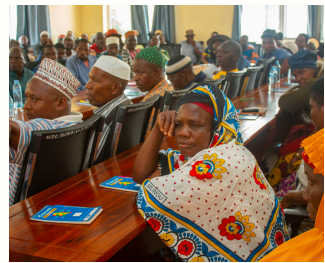
A traditional healers' orientation was held in Mlimba, Tanzania on the first week of September. Approximately 135 healers attended out of 160 invited.