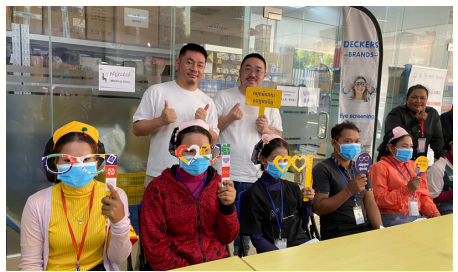
ECF and VisionSpring Clear Vision Workplace Program launched in March 2024