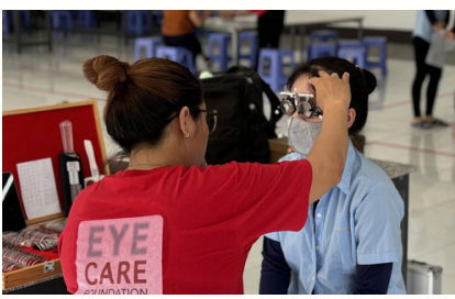
ECF Vietnam conducted the RARE & eREC study, which successfully screened 5,239 participants across three provinces.