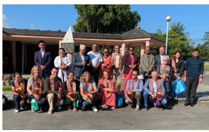
A donor group (8) from Tramedico, a Dutch pharmaceutical company visited Gorkha Lions Eye Centre and Himalaya Eye Hospital Pokhara.