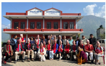
Likewise, a group of major donors (15) visited Gorkha Lions Eye Centre, Dhaulagiri Eye Hospital Baglung and Himalaya Eye Hospital Pokhara